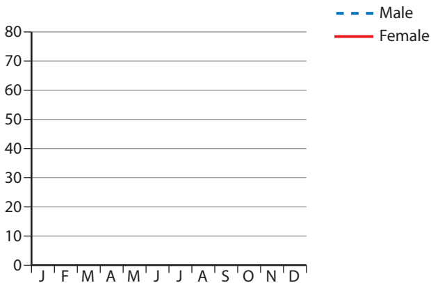
% students who visited the cinema at least once a month

You have a graph giving information about the percentage of students who visited the school website at least once a week over the same twelve-month period. Describe the graph to your partner. You can give the January and December percentages, but none of the other percentages.